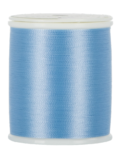
Straight wound thread Notice the parallel lines and the thread unwinding from the side.

If your machine doesn't have both a vertical and horizontal spool pin to accommodate different winding types, using a separate thread stand can help ensure proper unwinding. If you're still experiencing tension issues or thread breakage after adjusting your top and bobbin tension or changing needles, improper thread unwinding could be the cause.