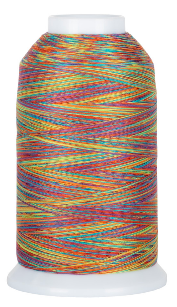
Cross wound thread Notice the X-like appearance and the thread unwinding from the top.